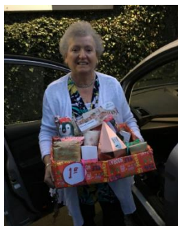
Guess who won the Christmas Hamper?

So please fasten yer seatbelts, extinguish yer cigarettes, an sit back relax as we have lift off wi' oor first newsletter for 2018.